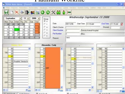
Platinum Drag and Drop Appointment Book